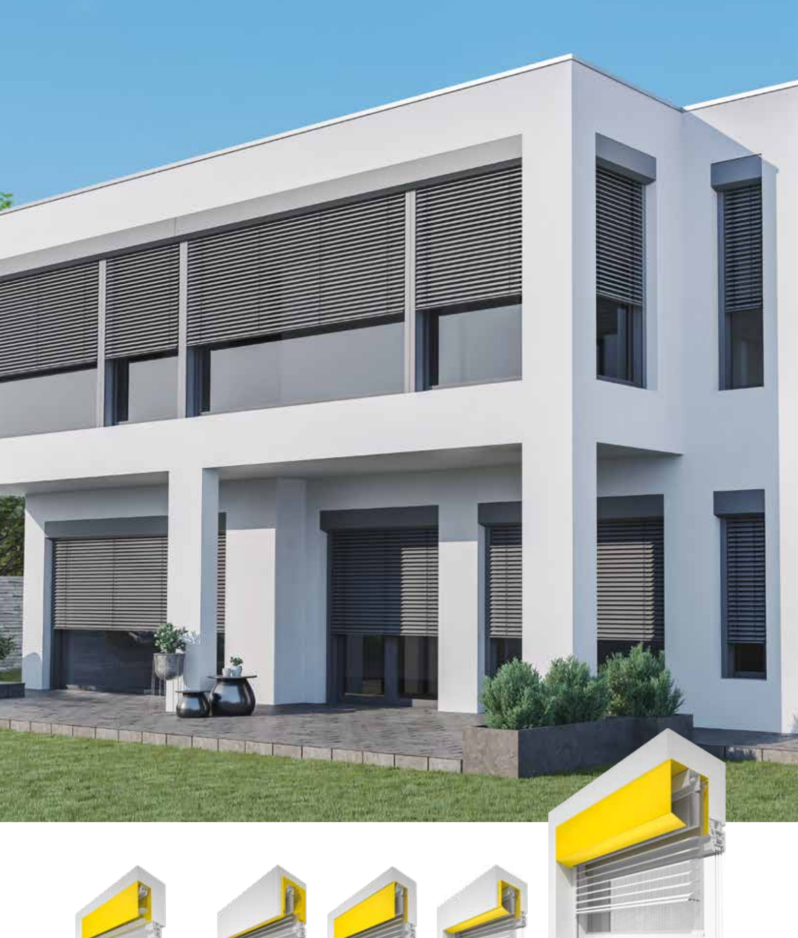
FACADE EXTERIOR BLINDS PLASTERED L-OR U-PANEL VISIBLE L- OR U-PANEL